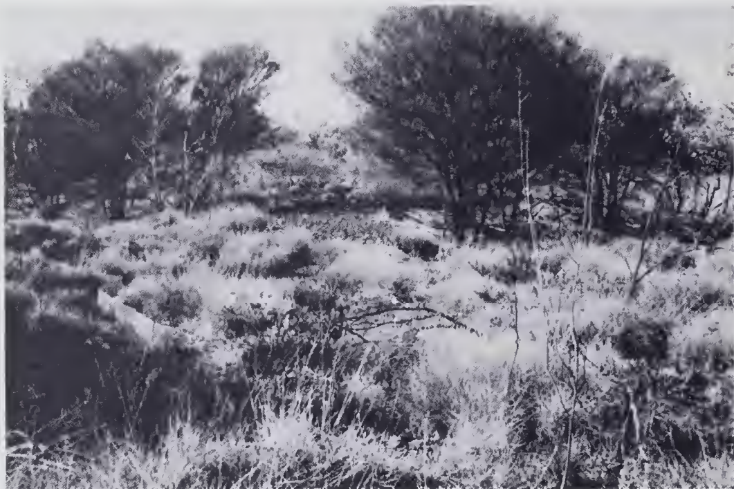
Fig. 1: Type locality of Pseudomys chapmani : the 'drift' fence leading to the pit trap from which the holotype was collected, is in the foreground among Triodia pungens .

pungens and T. basedowii with scattered Acacia aneura , Cassia desolata and C. helmsii ; the gibber plain with Eucalyptus gamophylla , E. oleosa , C. desolata and C. helmsii ) (Fig. 1).